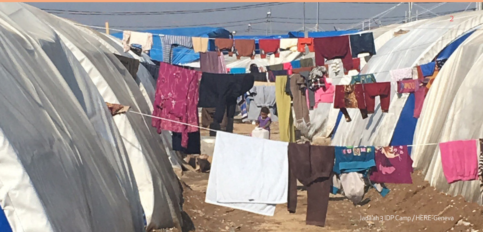
Jadā'ah 3 IDP Camp / HERE-Geneva