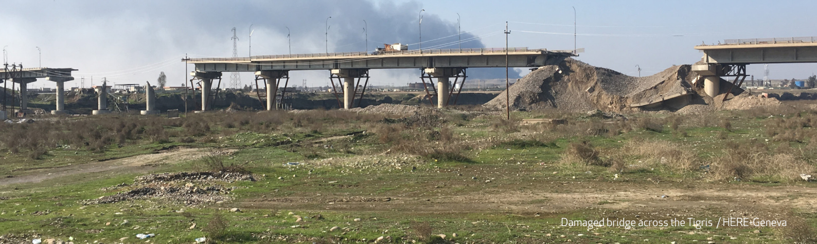
Damaged bridge across the Tigris