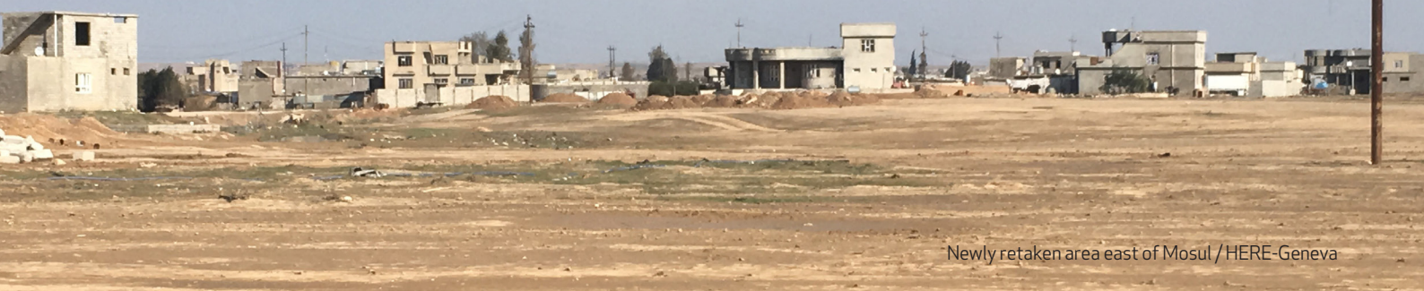
Newly retaken area east of Mosul