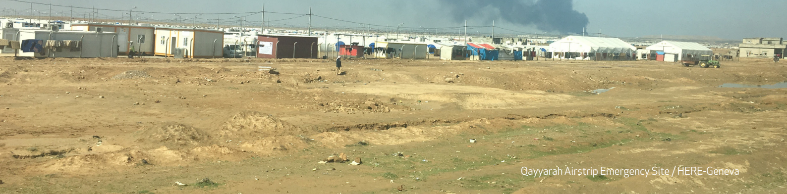
Qayyarah Airstrip Emergency Site

UN agencies, but also two NGOs, even highlight that providing support to the Iraqi government is part of their intended activities. It is also significant to note that in documentation received, eight of 13 partners make use of the term 'liberated areas', indicating an underlying assumption that there is a common enemy in the Iraq conflict from whom the country is being freed. The term 'liberated areas' was also used by five ECHO partner representatives in the interviews, though when questioned about this, all of them explained that it would be better to refer to 'newly re-taken areas', or 'newly accessible areas'. Several partners, not only the UN agencies, also use rather judgmental language when referring to ISIL in their documentation.