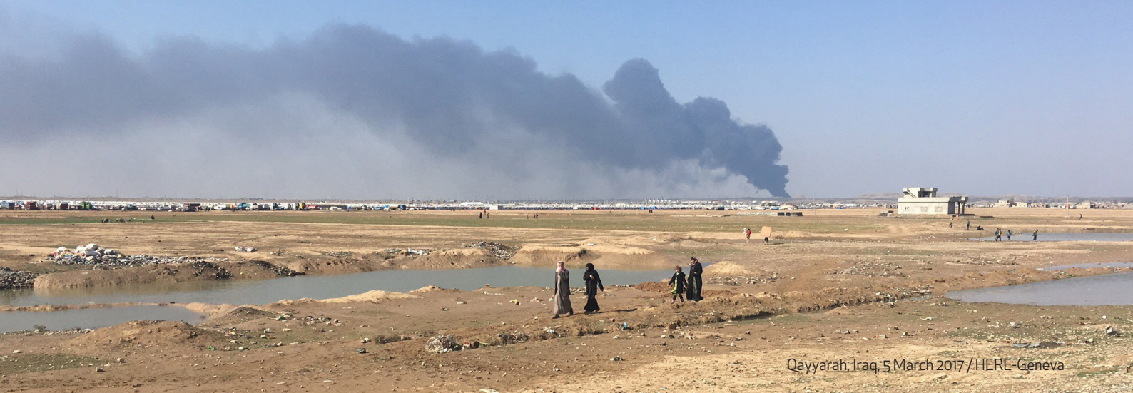
Qayyarah, Iraq, 5 March 2017

Team was told that other than informal contacts among donors there is no humanitarian donor contact or coordination group at the operational working level, as is the case in other countries. Several donors sit as members of the HCT in Iraq, including ECHO but little information is readily available as to the criteria for donors to join. The situation differs from country to country in terms of having donors on HCTs. In certain highly politicised contexts, donors do not participate in the HCT out of a concern that their political agenda may interfere with humanitarian decision-making. While the Review Team does not take a position on this issue, it would seem appropriate for donors, including ECHO, to reflect on the need for more formal coordination among them and to set up, in consultation with the HC and/or HCT, a mechanism for rotating their participation in the HCT or alternative coordination forum, as appropriate. Good donorship also requires coordination among donors.