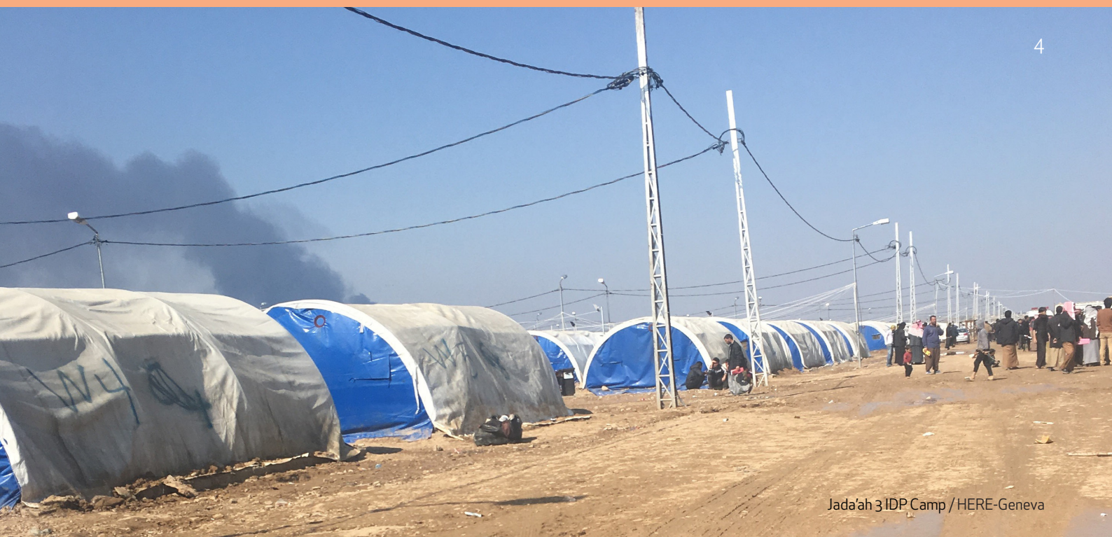
Jada'ah 3 IDP Camp

are aware of what to expect from one another. Such conversations are well-underway in a number of coordination mechanisms, but they can be stepped up further.